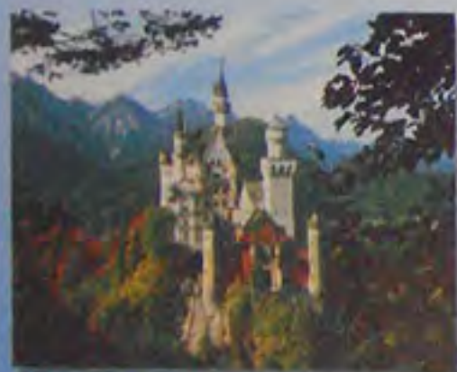
❁ 1500 ▶ 16236 9