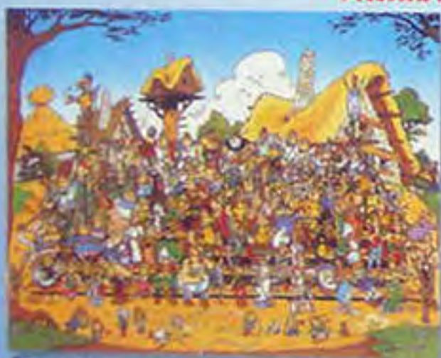
❁ 1000 ▶ 15434 0