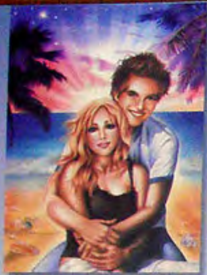
♣ 500 ▶ 14474 7