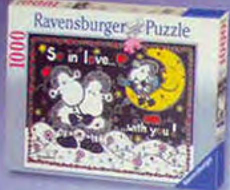
❁ 1000 ▶ 15385 5