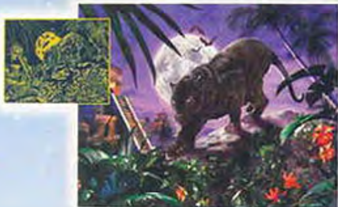
❁ 500 ▶ 14912 4