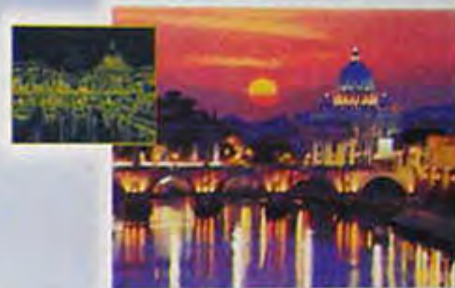
❁ 1000 ▶ 16093 8