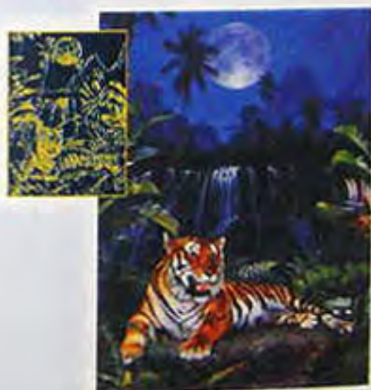
❁ 1000 ▶ 16077 8