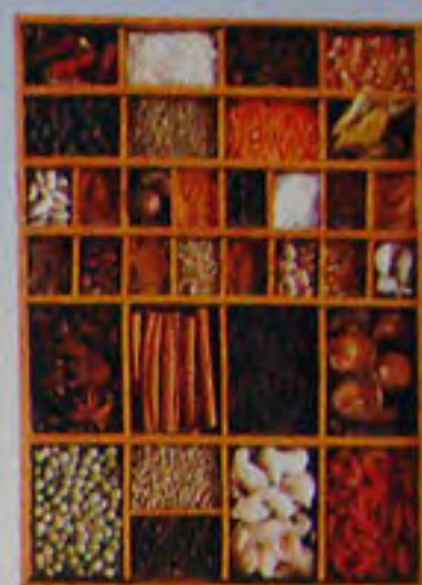
❁ 1000 ▶ 15610 8