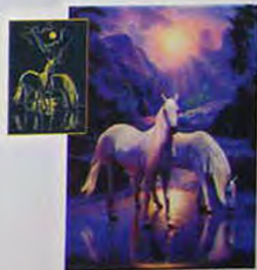
❁ 1000 ▶ 16086 0