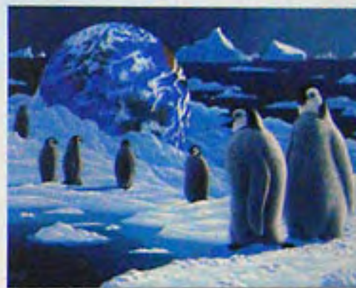
500 ▶ 14526 3