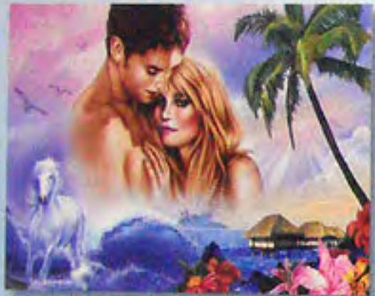
♣ 3000 ▶ 17026 5