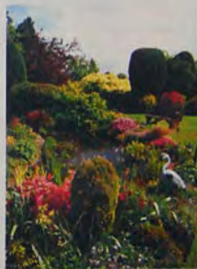
❁ 1500 ▶ 16215 4