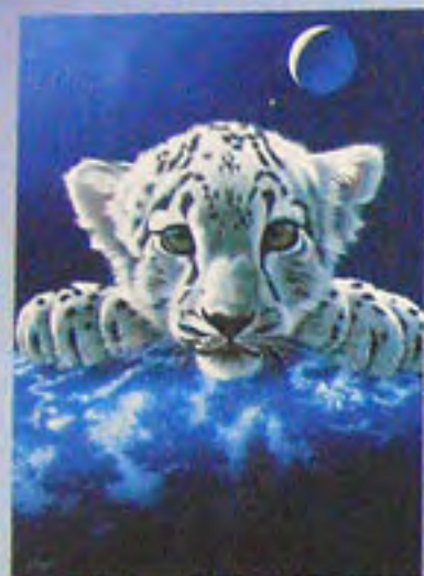
500 ▶ 14276 7