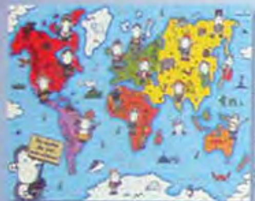
❁ 1000 ▶ 15295 7