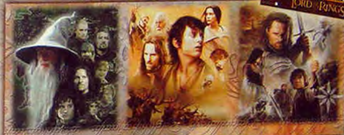
❁ 1000 ▶ 15103 5