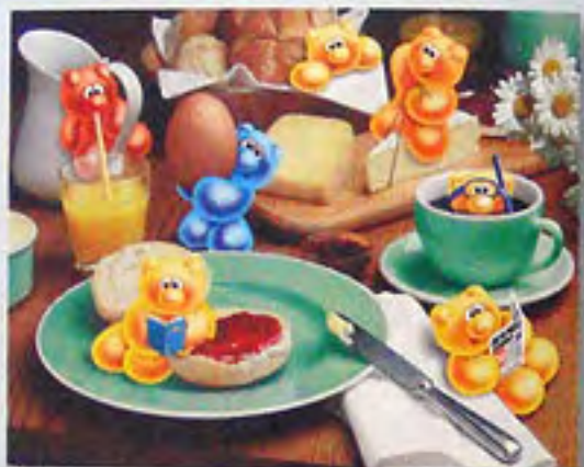
❧ 1000 ▶ 15869 0