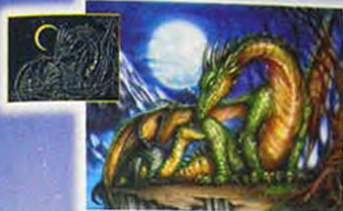
❁ 500 ▶ 14924 7