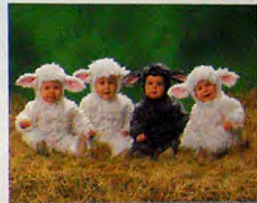
♣ 1000 ▶ 15377 0