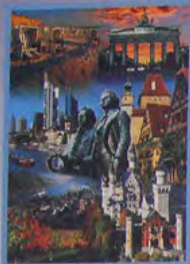
❁ 1000 ▶ 15331 2