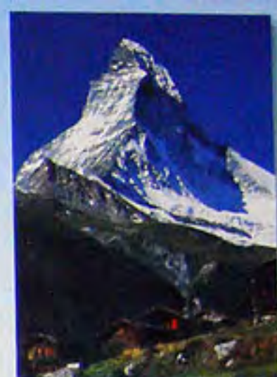
❧ 500 ▶ 14477 8