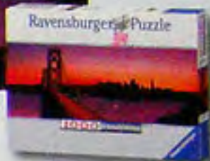
▶ 15104 2