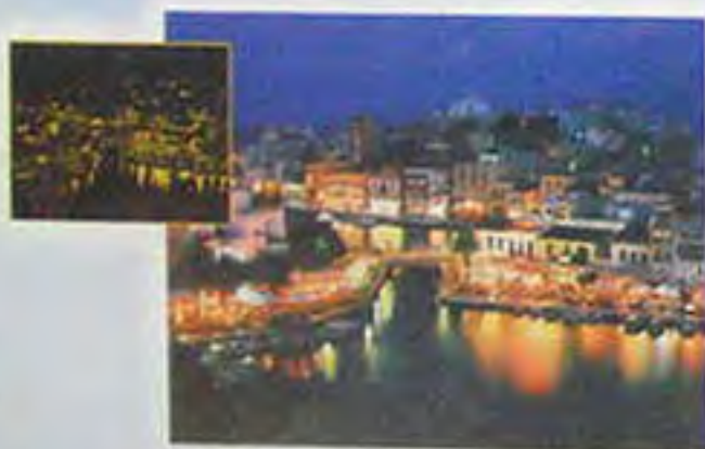
❁ 500 ▶ 14918 6