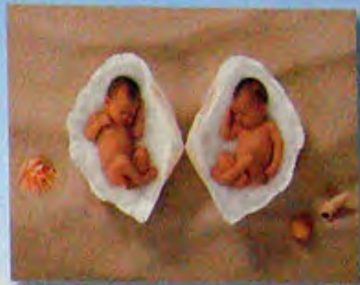
♣ 500 ▶ 14495 2