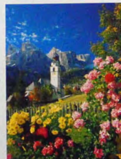
❧ 1500 ▶ 16214 7