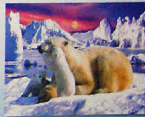
1500 ▶ 16371 7