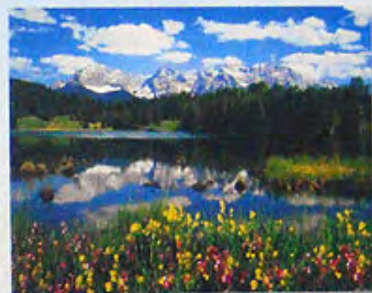
❧ 500 ▶ 14522 5