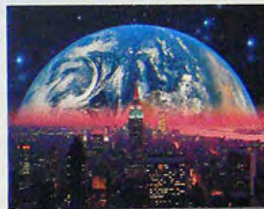
1000 ▶ 15547 7