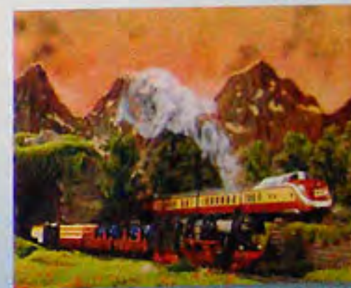
❧ 1500 märklin ▶ 16364 9