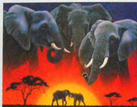
1500 ▶ 16356 4