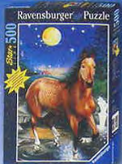
❁ 500 ▶ 14910 0