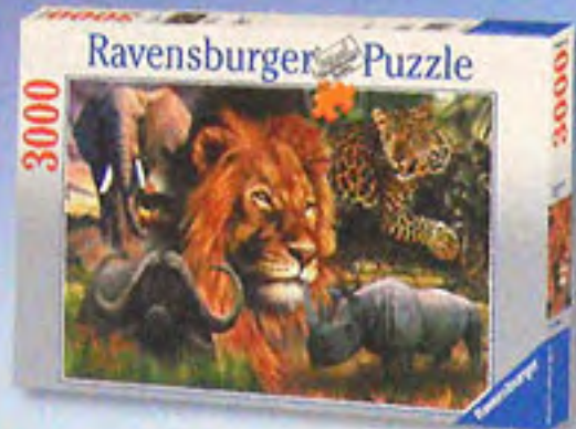
3000 ▶ 17051 7