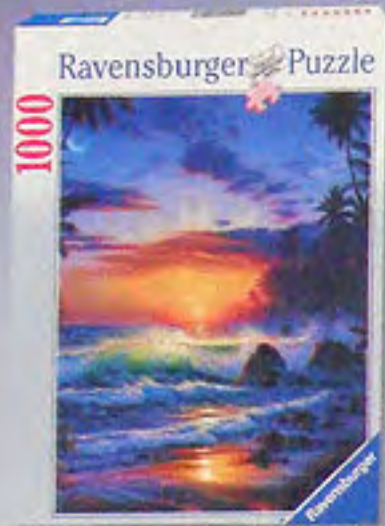
1000 ▶ 15650 4