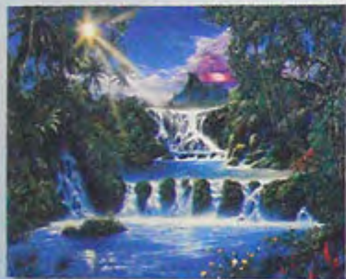
2000 ▶ 16657 2