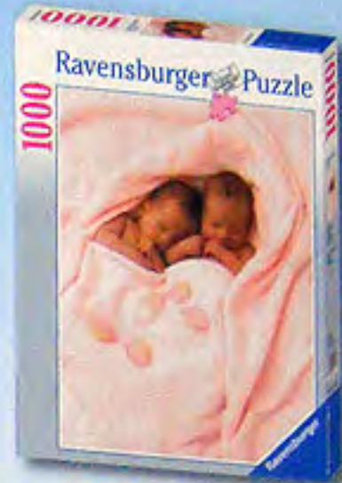
♣ 1000 ▶ 15374 9