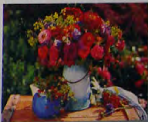
❁ 1000 ▶ 15347 3