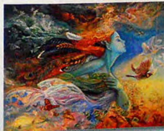
♣ 2000 ▶ 16623 7