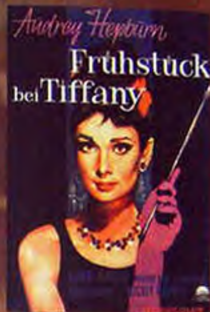
❁ 1000 ▶ 15382 4