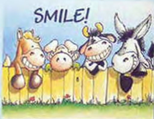
❁ 1000 ▶ 15320 6