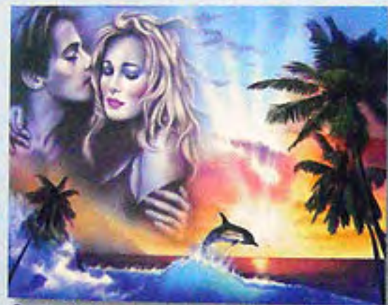
♣ 1000 ▶ 15450 0