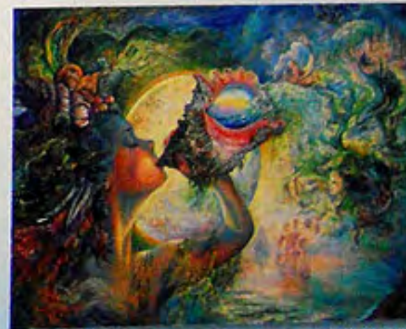
♣ 5000 ▶ 17416 4