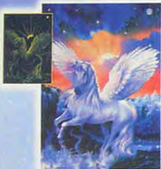
❁ 500 ▶ 14920 9