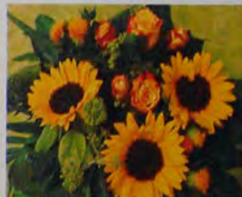
❁ 1000 ▶ 15617 7