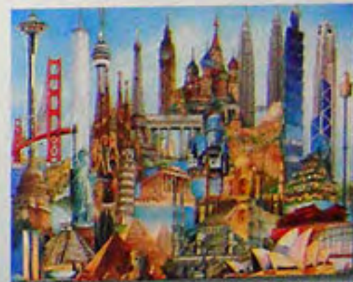
3000 ▶ 17052 4