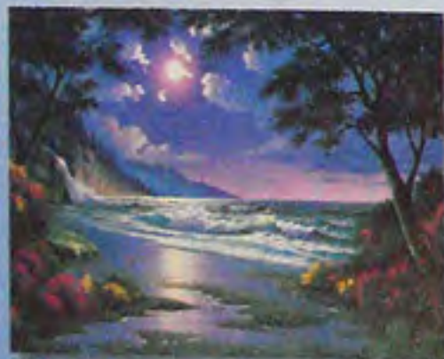
3000 ▶ 17009 8