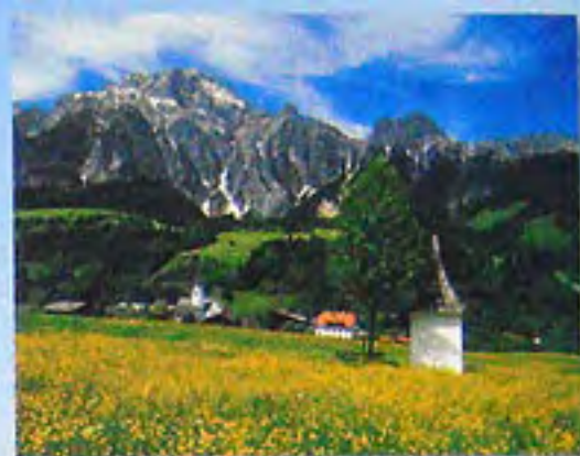
❧ 500 ▶ 14437 2