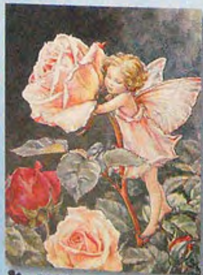
♣ 1000 ▶ 15326 8