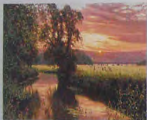
❁ 1000 ▶ 15277 3