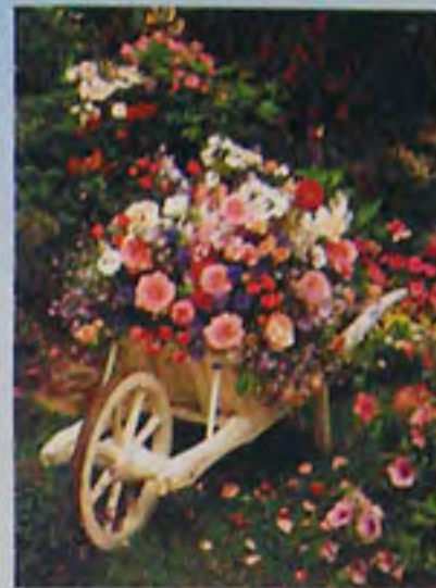
❁ 500 ▶ 14434 1