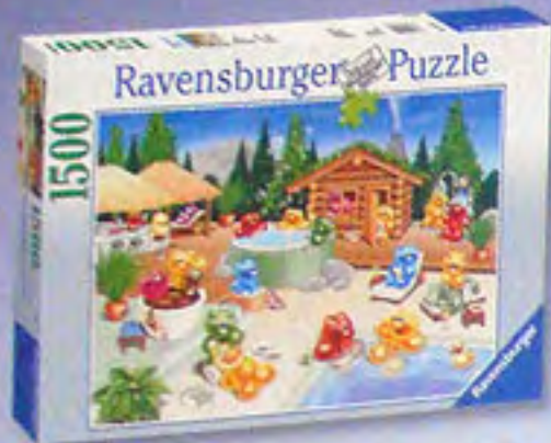
❧ 1500 ▶ 16378 6