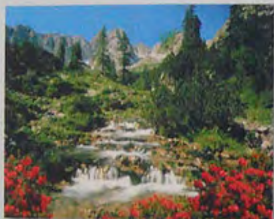
❁ 1000 ▶ 15459 3