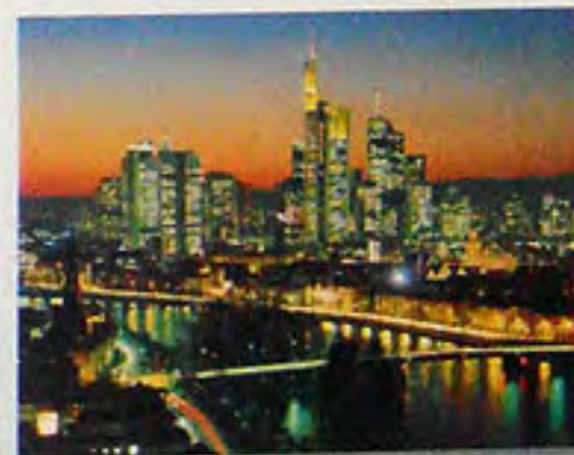
2000 ▶ 16656 5