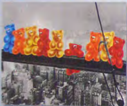
❧ 1000 ▶ 15813 3