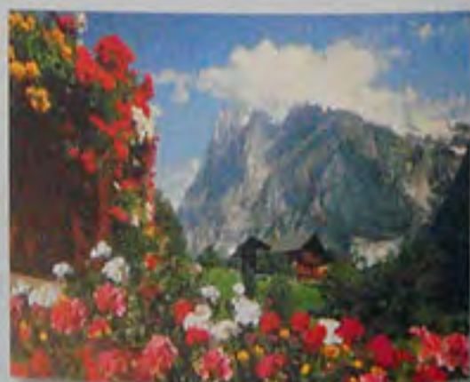
❁ 1500 ▶ 16335 9