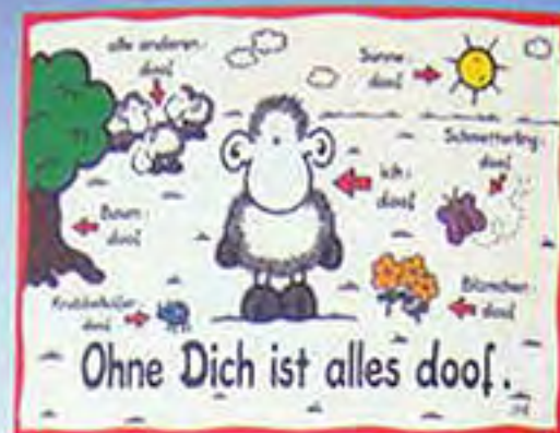
❁ 1000 ▶ 15321 3