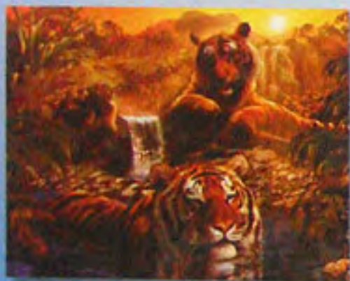
2000 ▶ 16646 6