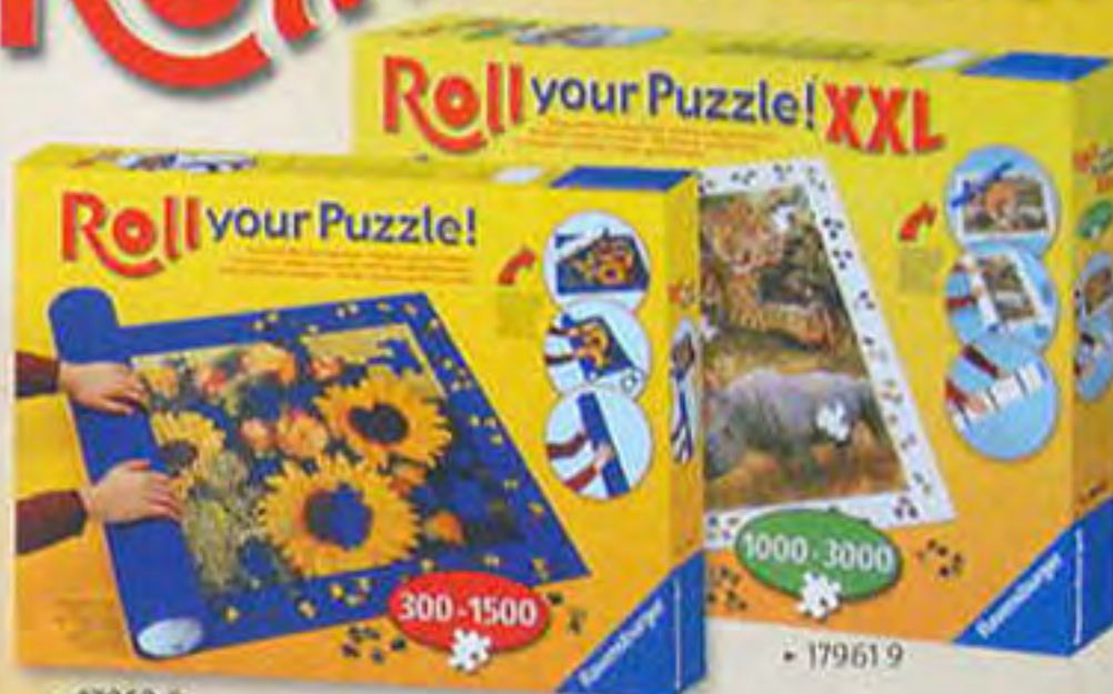
• 17959 6