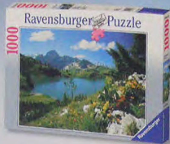
❁ 1000 ▶ 15438 8