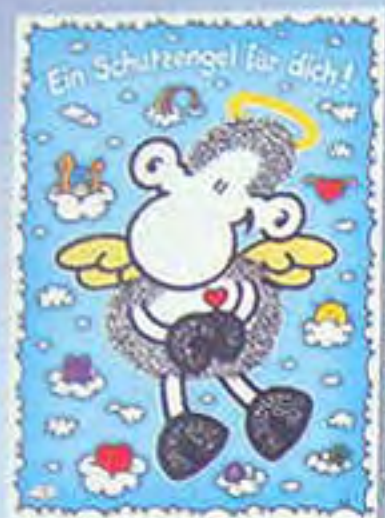
❁ 500 ▶ 14514 0