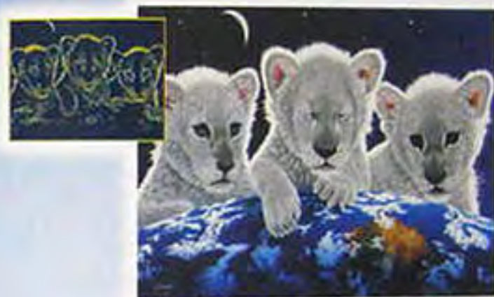
❁ 1000 ▶ 16067 9