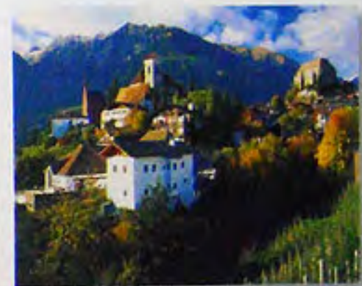
❧ 1000 ▶ 15340 4