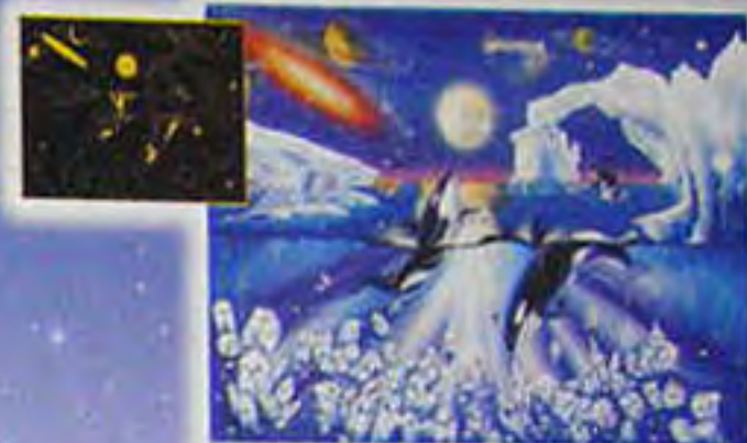
❁ 1000 ▶ 16096 9