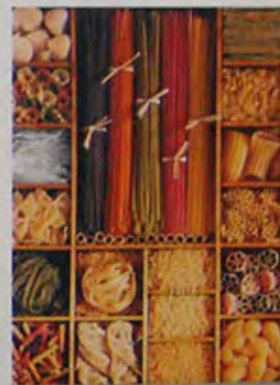
❁ 1500 ▶ 16367 0