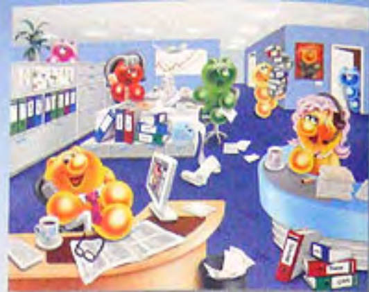
❧ 1000 ▶ 15298 8