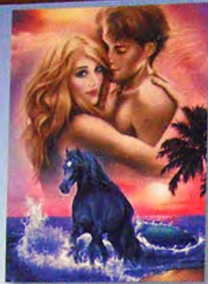
♣ 1500 ▶ 16212 3