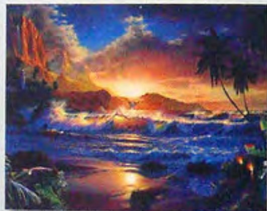
1500 ▶ 16311 3