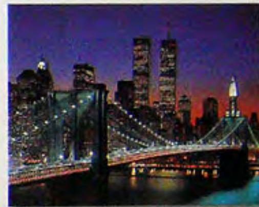
2000 ▶ 16609 1