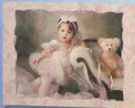
♣ 500 ▶ 14528 7