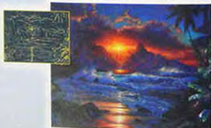
❁ 500 ▶ 14913 1