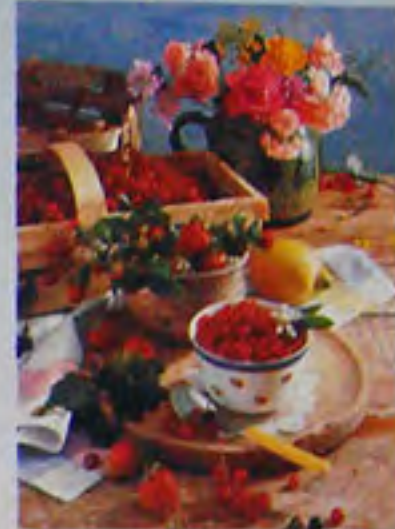
❁ 500 ▶ 14479 2