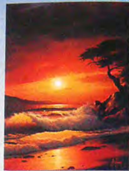
500 ▶ 14473 0