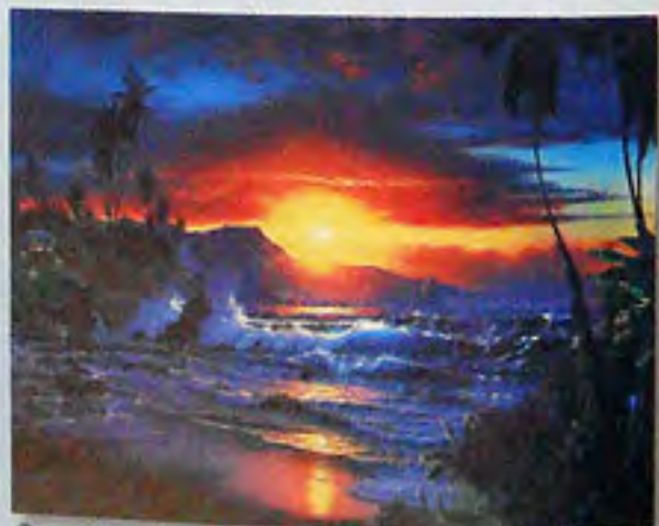
5000 ▶ 17414 0