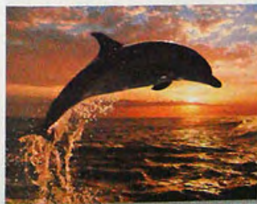
500 ▶ 14476 1