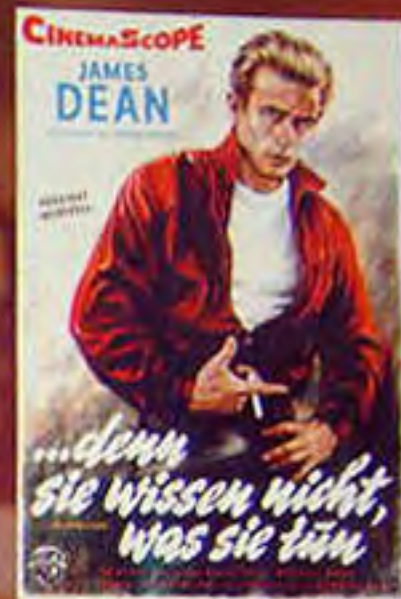
❁ 1000 ▶ 15328 2