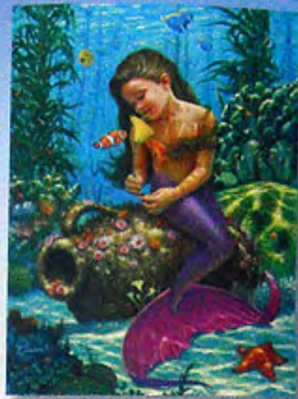
♣ 1000 ▶ 15338 1