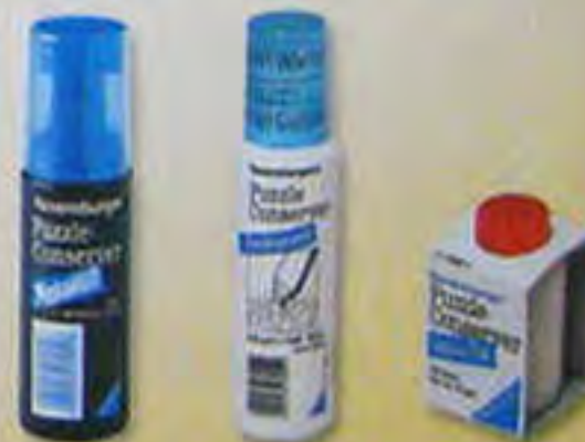
• 17955 8