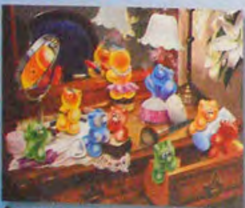
❧ 1000 ▶ 15476 0