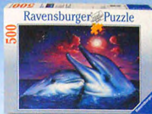
500 ▶ 14152 4