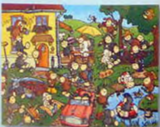
❁ 1000 ▶ 15387 9