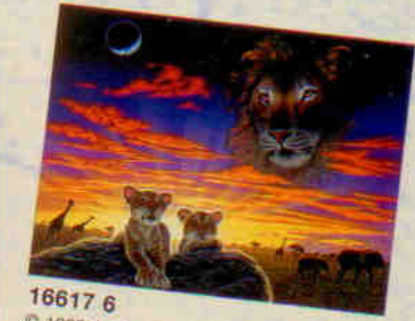
16617 6 © 1998 Schim Schimmel Art Impressions, Canoga Park, CA, USA