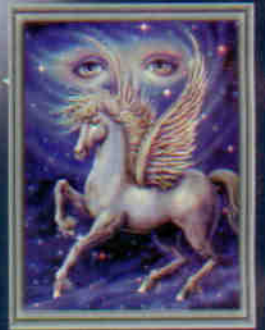
16017 4