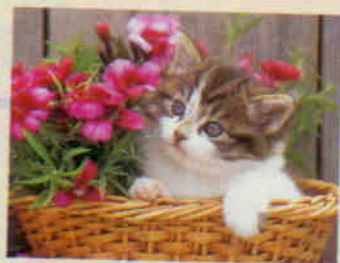
14218 7