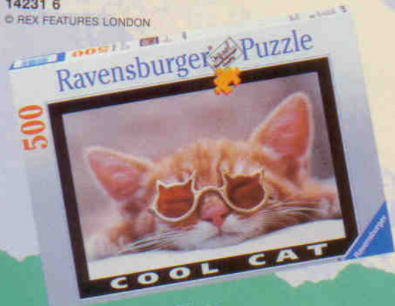
14231 6