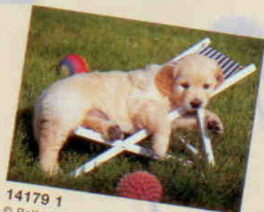
14179 1 © Rolf Köpke