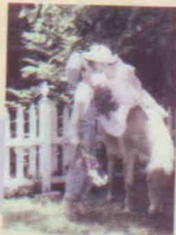
14224 8