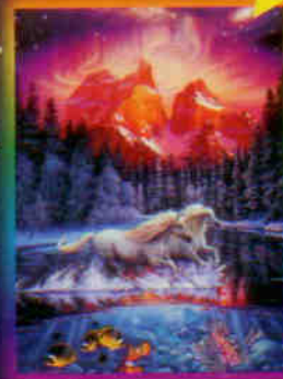
16107 2 © Christian Riese Lassen