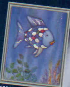
16015 0 'Lizensiert durch: Ravensburger Film + TV GmbH © 1992 Nord-Süd Verlag AG Gossau Zurich/Schweiz