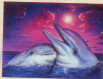
14152 4