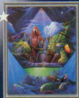
16018 1