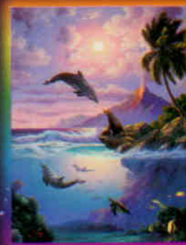
16106 5 © 1/1/95 ANTHONY CASAY