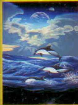
16056 3