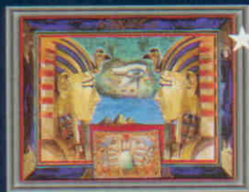
16406 6 © 1996 Joadoor/Verkerke Reproducties NV - all rights reserved -

Die Puzzle-Serie mit Metallic-Effekt! Puzzleserie met metallic-effect! La collection de puzzles à effets métalliques! Gli straordinari puzzles con effetto metallizzato! The metallic-effect puzzle range! ¡La serie de puzzles con efecto metálico!