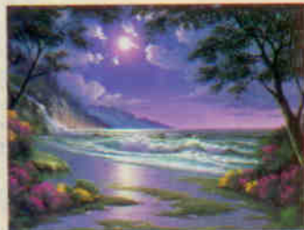
17009 8 © 1/17/96 ANTHONY CASAY