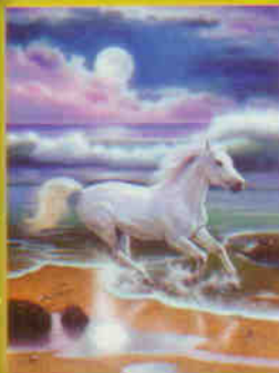
16054 9