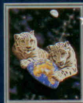
16402 8 © 1997 Schim Schimmel Art Impressions, Canoga Park CA, USA © MANIFESTATIONS™1997/ MAGIC EFFECTS®.