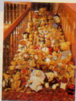
14207 1 With thanks to Colour Box Ltd. for the use of their Teddy Bear Collection.

Teile stukjes pezzi pieces pièces piezas