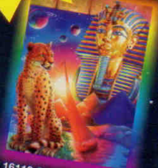
16110 2, © Gerold Coma