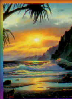
16101 0 © 5/12/95 ANTHONY CASAY