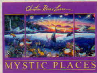
16615 2 © Christian Riese Lassen