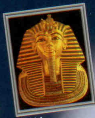
16004 4 © MANIFESTATIONS™1993