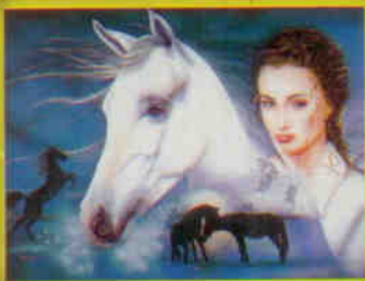
16068 0 Courtesy by Panther © Anne Didelot, 600977