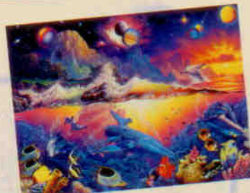
17012 8 © Christian Riese Lassen