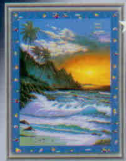
16014 3 © MANIFESTATIONS™1996/ MAGIC EFFECTS®. Courtesy by Panther. © Laographics