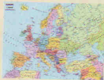
14229 3 © STIEFEL GmbH EUROCART, Ingolstadt