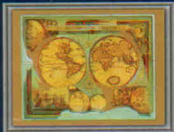
16009 9 © 1995 Gar Doornik - Verkerke C&L GmbH