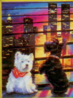
16065 5

Leuchtet im Dunkeln! Geft licht in het donker! Lumineux la nuit! Effetto Luminescente! Glows in the dark! Resplandee en la oscuridad!