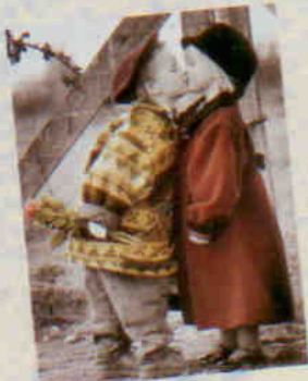
14184 5