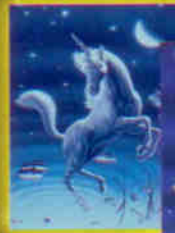
16057 0