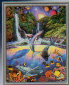
16403 5 © Christian Riese Lassen © MANIFESTATIONS™1997/ MAGIC EFFECTS®.