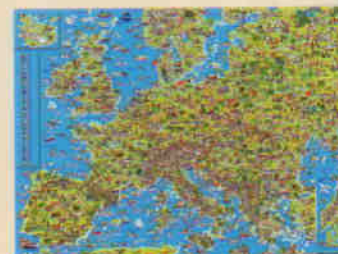
16610 7