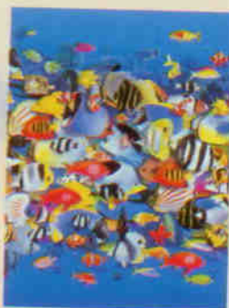
14205 7 © ROYCE B. McCLURE