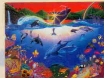
16608 4 © CREARE Illustration Studio/ Takahiro Kahie