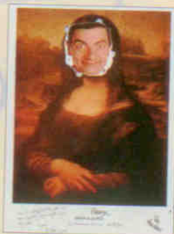
14236 1