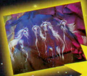
16053 2