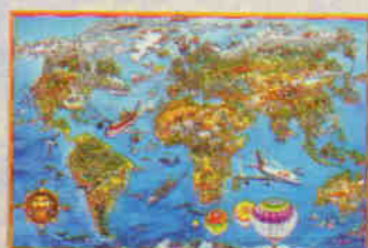
17406 5