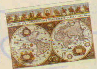
17054 8 © SCHULER VERLAG STUTTGART