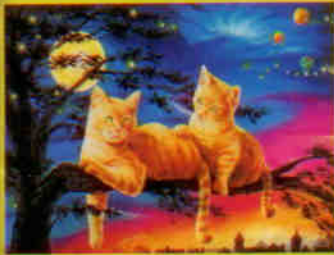
16064 8 © Gerold Coma