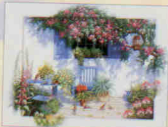
14226 2 © 1997 Sjatm BV - Holland/Painting by Peter Motz