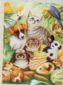
14217 0