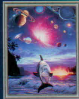
16019 8 © Christian Riese Lassen © MANIFESTATIONS™1998/ MAGIC EFFECTS®.